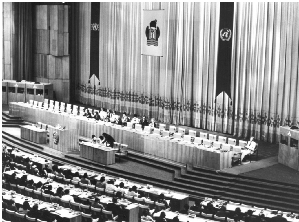
Alma Ata Conference, 1978.

These new approaches were spearheaded by Halfdan T. Mahler, a Dane, who served as director general of WHO from